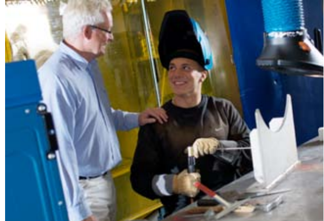
Protection and Safety Courses are frequently arranged at Nederman Educational Centres.