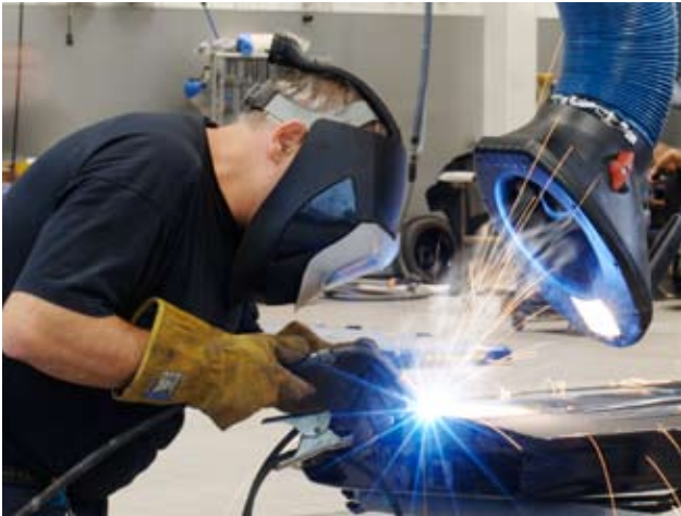
Fume extraction with a Nederman Extraction Arm

Control of exposure to welding fumes can usually be achieved with the help of extraction and ventilation. The choice of technique depends on the circumstances. The aim is to capture the fumes as close to the source as possible. This protects not only the welder but also other workers. Nederman systems are designed to extract welding smoke from a number of workstations but are also used for cleaning of workplaces and machines. The range also includes mobile units for welding fume extraction air as well as reel hoses for gas and compressed air and cable reels for electric power.