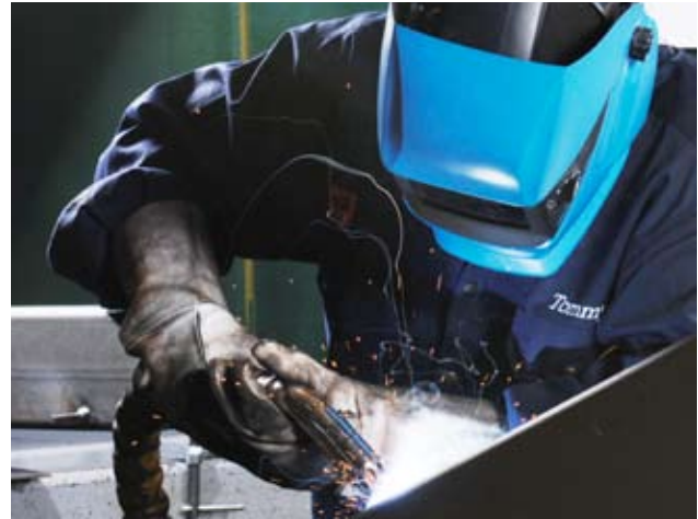
Welding torch with integrated fume extraction

Welding operations using automated welding equipment require careful monitoring. Operators and service personnel overseeing robotic welding equipment can be subject to residual fumes and need to be protected in a similar way to manual workers. Nederman solutions for automatic welding processes include both on torch-extraction and extraction systems with hoods.